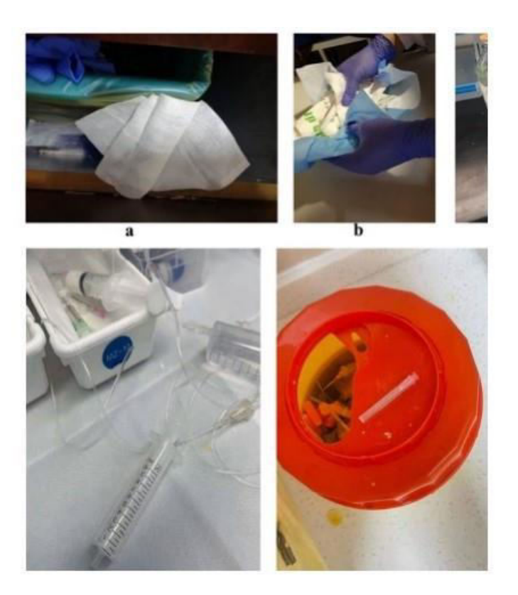
Fig. 1. Examples of the Medical Wastes

Following the suggestions from medical experts, eight categories of medical waste are considered as the typical illustration in this research respectively were gauze, gloves, infusion bags, infusion bottles, infusion apparatus syringe needles, tweezers and syringe. More specifically, the dataset classification and corresponding sample size are shown. It is not difficult to see from the table that the sample size of the eight kinds of medical waste was basically balanced: sample gauze had the most images (508), and sample syringe the fewest (369). The sample size distribution was workable for algorithm classification.